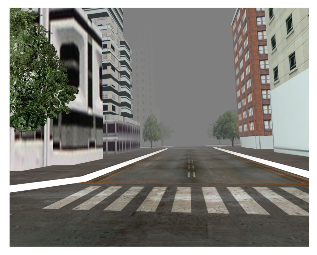
Figure 2. Foggy virtual city. doi:10.1371/journal.pone.0055003.g002

participant an opportunity to help by picking them up. During Stage 3, participants went to a small testing room and completed several surveys.