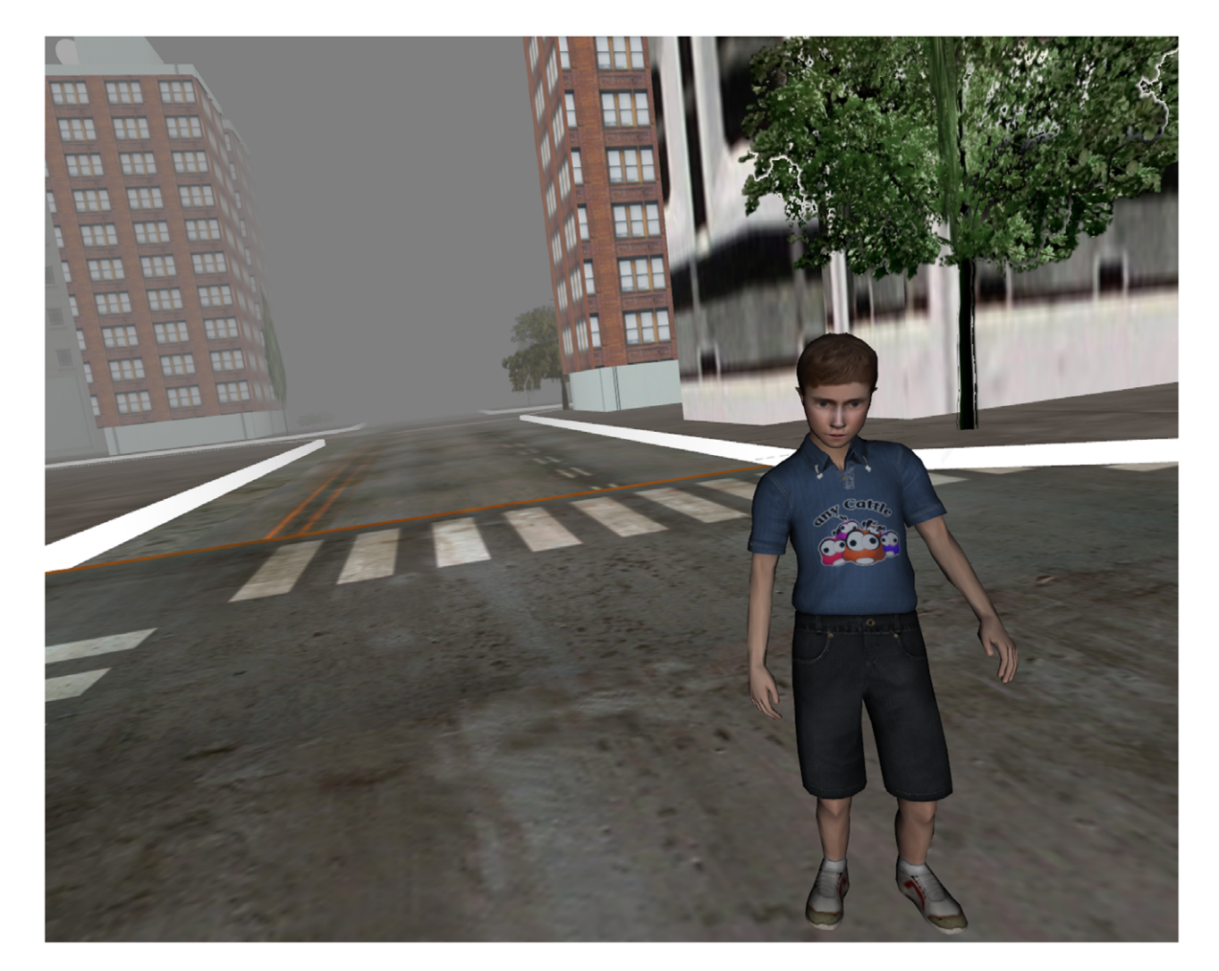
Figure 3. Virtual Child After Being Found and Saved. doi:10.1371/journal.pone.0055003.g003