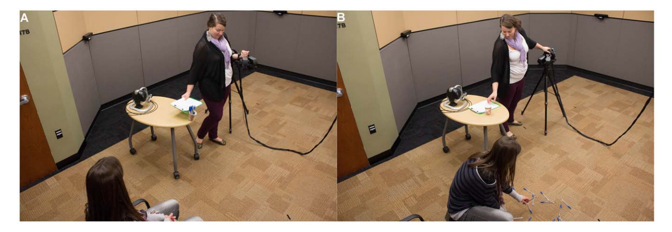
Figure 4. The Experimenter Knocks Over The Pens And A Participant Kneels To Help Pick Up Pens. In Panel A, the experimenter is "accidentally" knocking over the pens; in Panel B, a participant gets out the chair and kneels to help pick up the pens. Note: The images are slightly blurry as the surveillance cameras do not capture in high resolution. doi:10.1371/journal.pone.0055003.g004